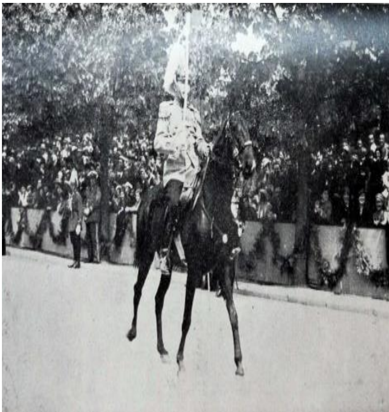
General Constantin Dimitrescu

Starting with May 26, 1929, by the Decision of the Minister of the Interior no. 880/929, 1674 horses were given to the army ministry, and 670 horses were left to the Rural Gendarmerie. By the General Circular Order no. 3 of 22.02.1930 it was ordered to keep the troop horses at the sections and positions until the fodder was finished, after which they were to be given to the Ministry of the Army, and only the officers' horses remained at the legions' residence.