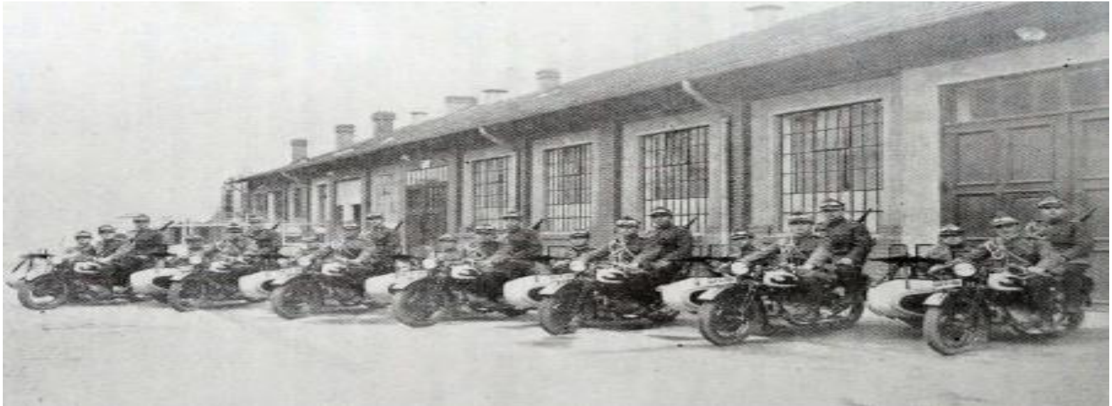
Motocycles in the service of the Romanian Gendarmerie

The increase of the dissatisfaction of the population, as a result of the economic crisis, but also the intensity of the radical and extremist political activity, determined the General Inspectorate of the Gendarmerie to increase its number. By the Order of the General Inspectorate no. 2982 from 1932 were established 40 sectors, 14 reserve groups, 3 riding groups, 9 motorcycle patrols, 95 positions with 10 gendarmes, 379 positions with 7 gendarmes, 285 positions with 5 gendarmes and 620 positions with 3 gendarmes.