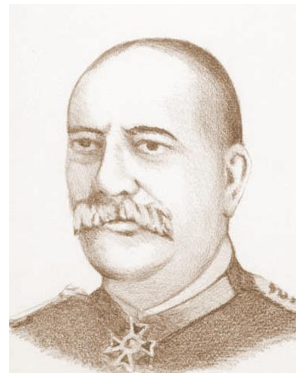
General Davidoglu Cleante

The Domains Service continued improving some buildings belonging to the General Inspectorate of the Gendarmerie, but also those that were state property. The necessary furniture was purchased for the Inspectorates 4 Cluj, 5 Craiova, but also for the Gendarmes Legions Vlașca, Teleorman, Alba, Iași. The work continued at the headquarters of the General Inspectorate, constructions that started in 1928 at the initiative of General Davidoglu Cleante, former commander of the Rural Gendarmes Corps. In November 1929, the General Inspectorate and the Gendarmes Inspectorate I of Bucharest moved into the new building. In order to this building to be constructed, the amount of 36,000,000 lei was spent. The work performed by military craftsmen, led to an economy of 14,400,000 lei, thus 50,400,000 lei would have been spent. The building is a work of art, Roman-medieval style executed under the supervision of Lt. col. C. Ionescu Beldiman, the head of the Construction and Domains Department of the Rural Gendarmerie, assisted with technical part by the architect I. Mandi and the builder I. Risu. The plans were accomplished according to the instructions of the Inspector General and the Military Domains Service.